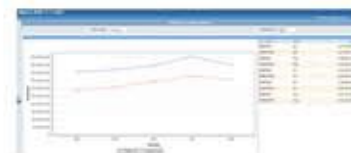
Creditors Vs Debtors